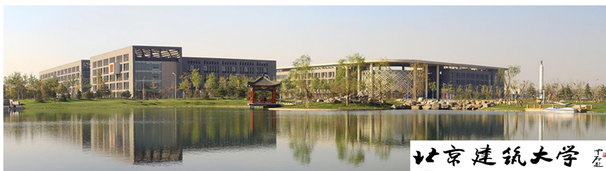
Beijing University of Civil Engineering and Architecture