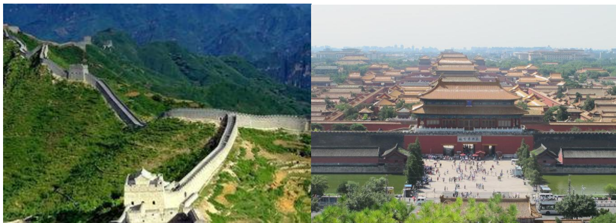
中国，北京 Beijing, China